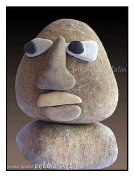
Simple man