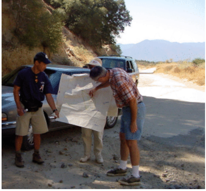
Noting granite as we crossed the boundary of the North American Plate

Tim discussed the BIG QUAKE of 1857, and the smaller brother in 1960 (only magnitude 5). We are overdue for another big one to relieve the stress in this active area. At Wallace Creek in the 1857 quake, the plates moved over 30'. Another actively moving plate can be seen at Avenue S on Highway 14 in Palmdale (tectonic pressure ridge). A third example of shifting is along Gorman Post Road, just to the east of greater, downtown Gorman.