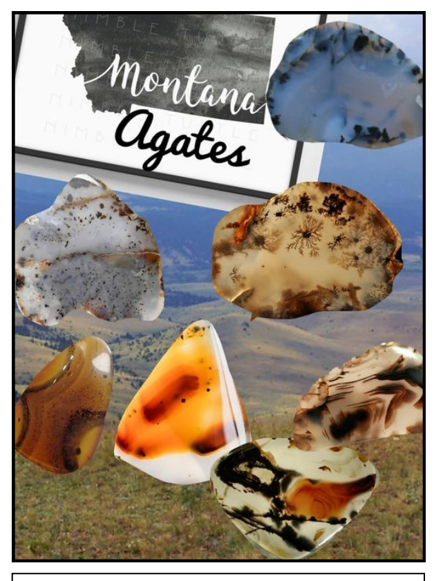
Variety in Montana Agates from <u>Rock-hound Conection</u> September 19, 2020, Cheryl Mannerow-Tucker

Read more at: <u>http://www.geologypage.com/2016/10/worlds-</u> biggest-pearl-found-china.html