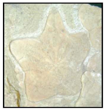
"Happy Star" — New Cuyama Vaquerosella coryei ~15 mya