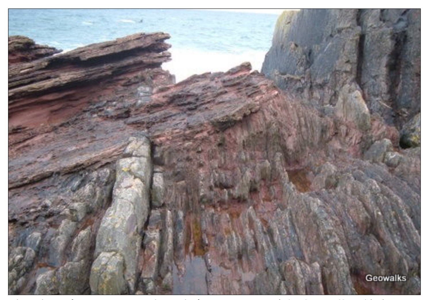
The angular unconformity at Siccar Point emplacing rocks of Devonian Age ~370 mya (red sandstones and breccia) (top) perpendicular to rocks of Silurian age (~435 mya) (greywacke, sandstones and mudstones.

country. A movie about her is simply titled "The Duchess", but does not go into her rock collection.