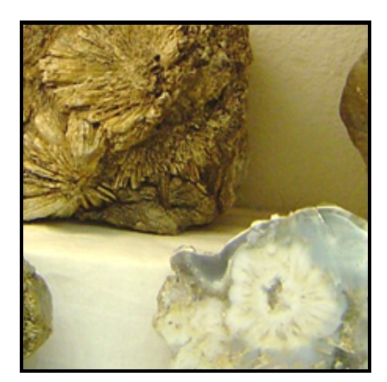
Aragonite Sagenite Agate—SLO-1

Friday - Sunday August 2 - 4, 2019 (10-5 Fri & Sat, 10-4 Sun) Nipomo High School, 525 N. Thompson Ave, Nipomo, CA