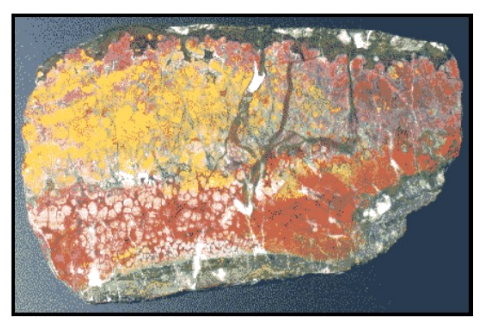
"Flower" Jasper—Figueroa Mt.