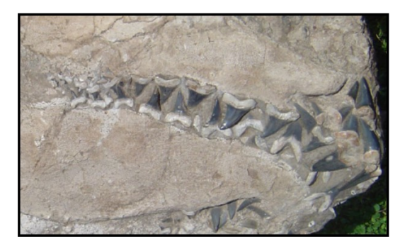
"Jaws" — Gaviota Coast Isurus sp. ~15 mya