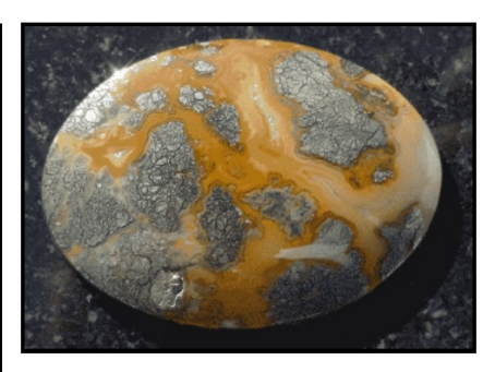
Marcasite Agate —Nipomo

Nipomo High School 525 N. Thompson Ave Nipomo, CA