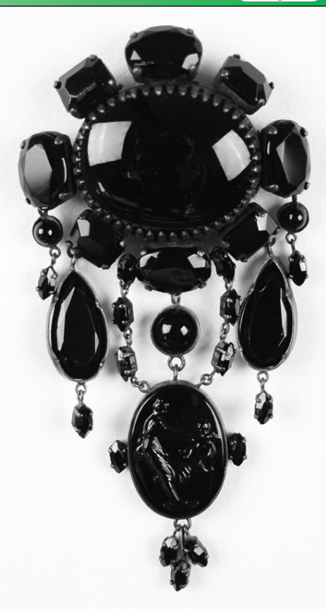
19th Century Mourning Brooch made from Jet. Photo by Detlef Thomas [CC BYlicenses/by-sa/2.0/de/deed.en)]

Jim also told us of the spot where the first thin section of petrified wood was made, and the ~410 mya Rhynie Chert in Aberdeenshire,that holds examples of the first land plants, and is (unfortunately) off-limits for SA 2.0 de (https://creativecommons.org/ collecting.