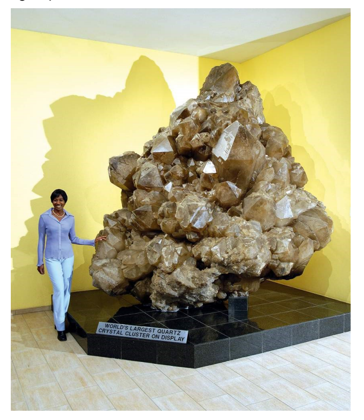
Quartz from near Karabib in Namibia, Africa

Quartz is one of the most abundant minerals at the Earth's surface. It is composed of two elements— Silicon and Oxygen (two atoms of oxygen for every atom of silicon), So its formula is SiO<sub>2</sub>. Quartz forms in the hexagonal crystal system, and depending on how and where it is formed, can occur in several forms including sceptered (on a stalk), double-terminated ("faceted" on both ends like Herkimer Diamonds), or attached to each other as this crystal group from Africa.