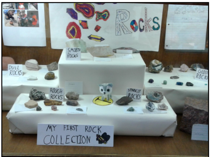
MY FIRST ROCK COLLECTION: Dull rocks, Rough Rocks, Smooth Rocks, Sparkly Rocks, Glossy Rocks (and maybe ugly or icky rocks!)