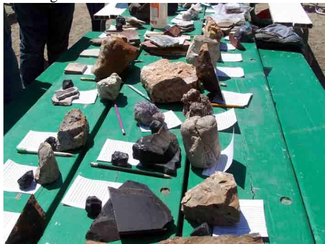
Some of the "goodies" in the Silent Auction. Soon it was time to clean up, pack up, and go to the rock pile.

as well a spirited silent auction that made $64.50 for our general fund.