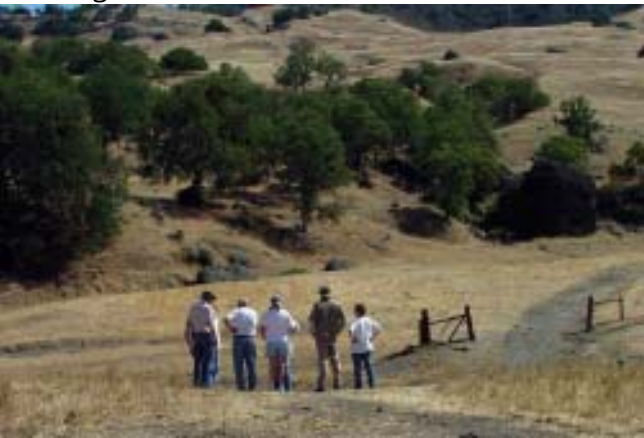
Crossing the San Andreas? No sweat with my pickup!