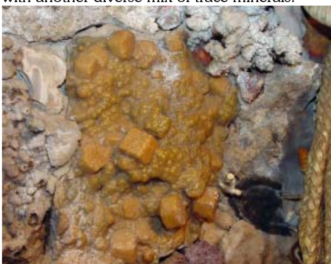
Chalcedony pseudomorphs after aragonite in the fireplace wall

The red lava rock covering Woodward Ranch was penetrated from above by water, silica, and trace elements which seeped down through the ash. Vents from below worked their way to the surface and riddled the lava with another diverse mix of trace minerals.