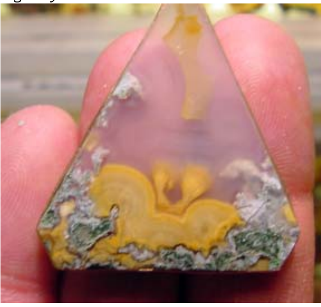
Pegasus, the winged horse (head to the left), aragonite in iris agate

There are a few RV sites on the property, and hotel rooms are available in Alpine, 16 miles to the north. Big Bend National Park and Terlingua are about 100 miles to the south on highway 118.