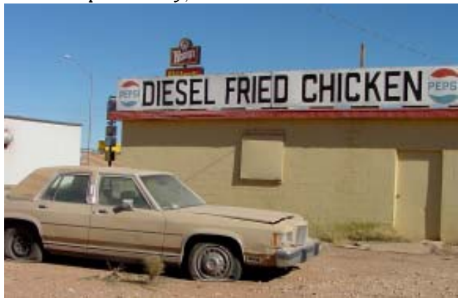
We chose NOT to eat here

Deming NM: We visited Rockhound State Park to the southeast of Deming. The pull-through spots are clean, modern, and easy to access. Geode Kid's Rock Shop is nearby, but he wasn't home.