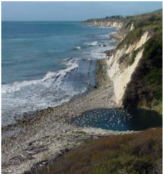
Coastline several miles west of Refugio

The teachers divided the group with half attending an orientation at Arroyo Hondo Preserve, and the other half remaining at Refugio Beach. The students were attentive and polite as the "Rock Talk" was given. Each student received an information sheet about rock types and local geology, a poke sack with local rock samples, a baby geode, a quartz cluster, and a topaz crystal. The talk was followed by a hike on the beach to locate the geologic features I had mentioned.