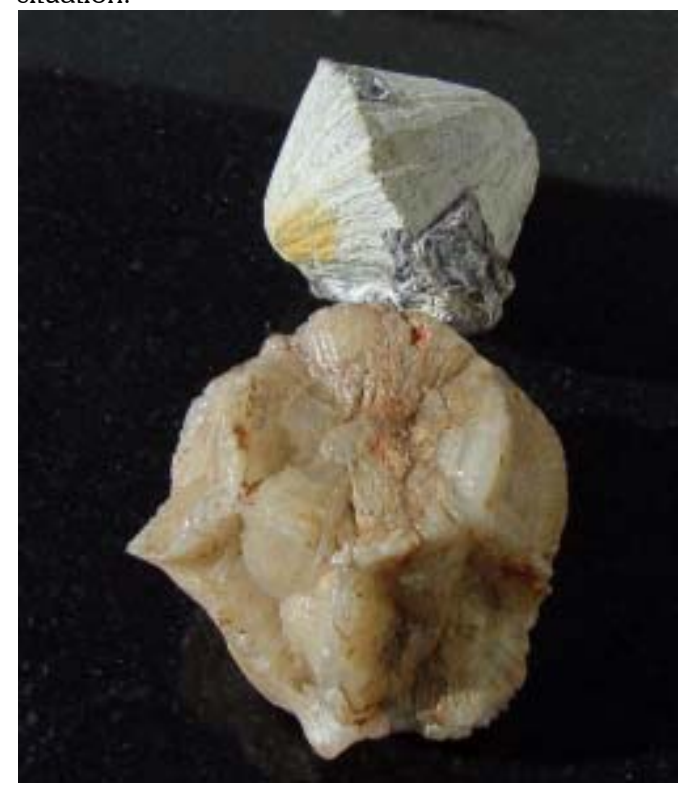
Oregon Multi-conoid and Biconoid from Ralph Bishop

shrouded in confusion. As I was growing up, the locals insisted that these agates were the casts of fossil shellfish. It was a point of local pride. One reason for the confusion is that the biconoid fields occur in massive beds of Monterey shale in and around all the biconoid producing areas. This formation produces many marine fossils. In addition, the biconoids were mistakenly identified by an academic authority as marine fossils. This did not help the situation.