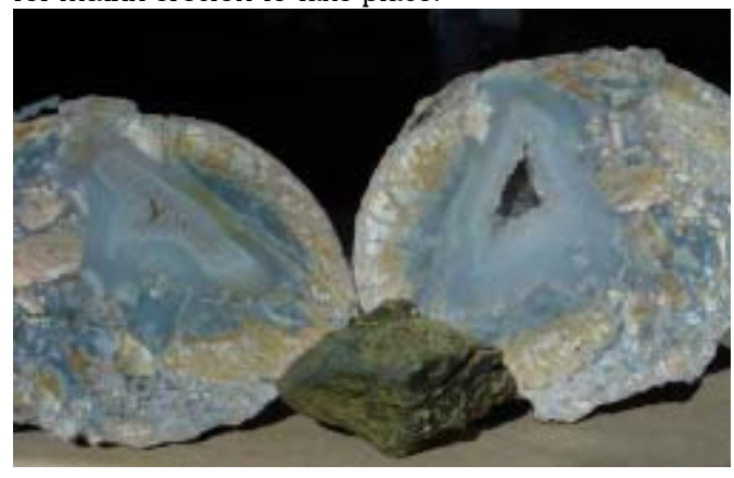
Highway 46 Thunderegg and Biconoid from Wes and Jeanne Lingerfelt's Collection

Matrix-free biconoids reinforce the theory that they were slowly washed down over a long period of time from a mountain farther west. That would have caused the rhyolite (Mohs 4) matrix to be slowly tumbled away, leaving only the harder (Mohs 6.5) agate biconoids. This slow journey may also explain why some biconoids are so severely worn down that they resemble rounded cobble. Yet other biconoids have been found with thick matrix, and it is theorized that they were rapidly washed down from their original source in a catastrophic slurry of mud and gravel, so that there was no time for matrix erosion to take place.