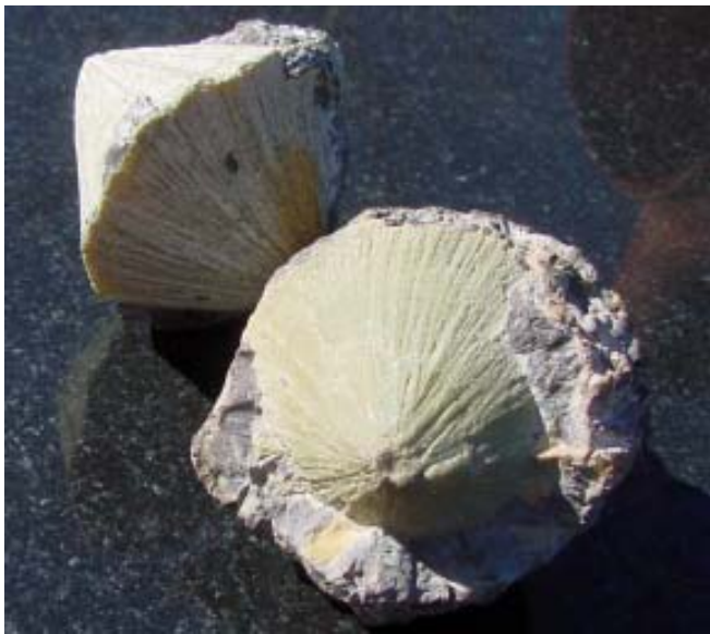
Frieda Biconoids from this collecting trip

tremely symmetrical with a green frosting. They were just beautiful. At the end of the dig we were tired, dirty, and the Kid was bunged up from corners he and the 3-wheeler had missed.