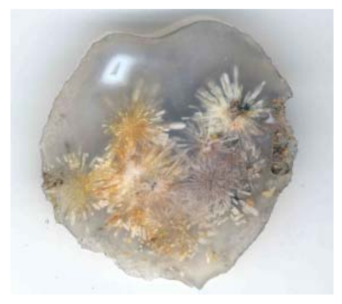
Ralph Bishop's latest prize: Freshly cut Aragonite Sagenite from Nipomo