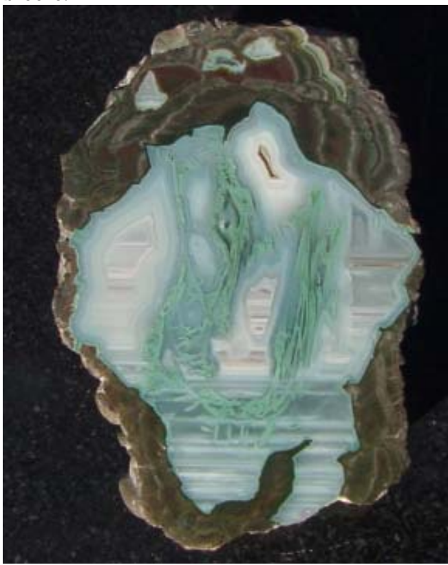
Frieda nodule with a mixture of depositions

hairpin switchbacks. We had a little widening to do on both the straightaways and especially the switchbacks, but by noon we were on the bench overlooking the river a couple hundred feet below. The river narrowed below the bench, and the rushing sound was a dominating presence during the entire trip. So was the crisp odor of fresh cold water on the constant breeze.