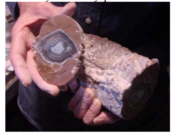
Lithophysae tube with biconic center

The inside of a thunderegg can be a chaotic, undefined, erratic structure (9, 7, 13 cores like biconoids) or, at the other end of the spectrum, can be a perfect biconic core. Paul's collection has examples of the typical forms, as well as many extraordinary specimens.