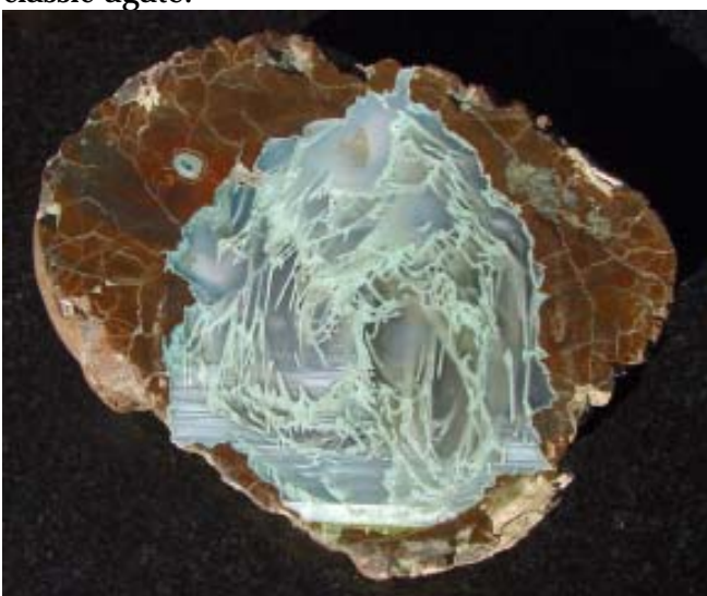
Frieda nodule with colloform growths circumfused by translucent chalcedony, giving the moss a depth of view like a diver would see underwater

structure and hangs like lace in a transparent background. It probably is Oregon's rarest classic agate.