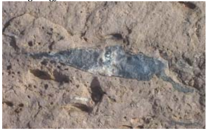
Balmorhea agate in andesite (built into the dam)

We drove through craggy hills with steep, ragged escarpments which reminded us of moon-scape photos with contrasting black, then red soils. Once we reached Balmorhea Lake, the private campground store sold only a few fishing necessities, sodas, rockhunting permits (required!), and ice. The attendant pointed us toward the hunting area, but no map or published literature was available at the store. A lot of the surrounding area is private land, so check before you collect! Bring your own rockhounding locations book for information on the area's geology.