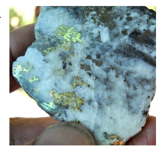
Gold in matrix (location unknown) from author's collection

A local group Central Coast Gold Prospectors continues the passion of searching for gold wherever it occurs.