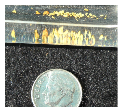
Gold panned from $45 commercially purchased bag. Probably less than 1/31 Troy ounce (one gram).