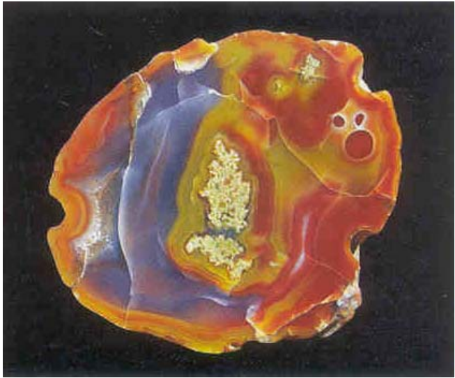
Another colorful Queensland Agate from Paul's display

magnificent displays of their most valuable and historic agate artefacts and specimens. I saw huge bowls, vases, boxes, animals and creatures carved from agate. One of the most unique showcases which included a video was of agates collected from the bottom of Lake Superior in Canada.