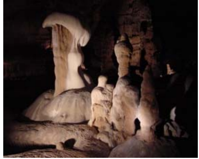
Incredible limestone formations in "Cave Without a Name", Boerne, TX

While the womenfolk usually stay close to home, cooking piles of food for hungry hunters, we catch up on family news, and have our own (antique hunting) adventures. I hope to make another trip to the Llano Uplift, complete with a bountiful picnic basket lunch.